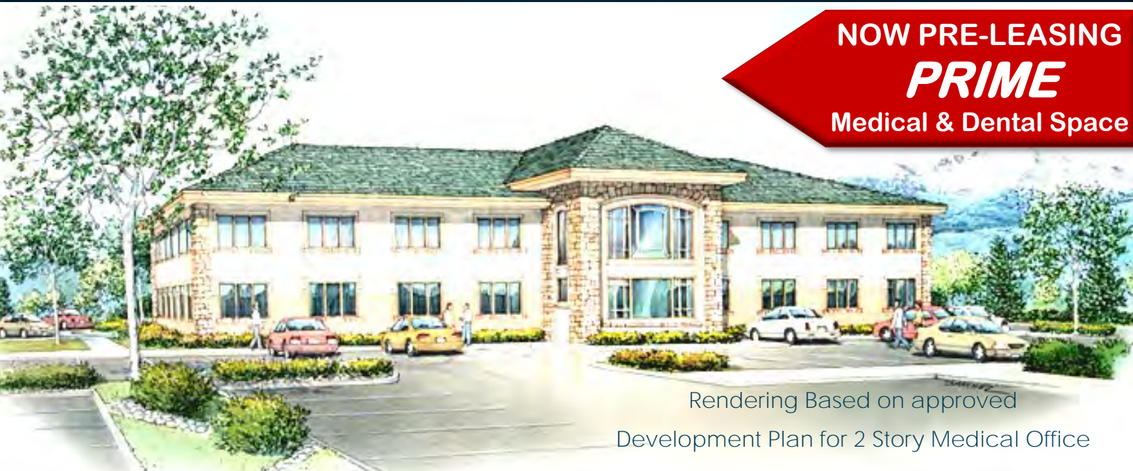
Rendering Based on approved Development Plan for 2 Story Medical Office

NOW PRE-LEASING PRIME Medical & Dental Space